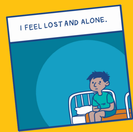
29 years old Afghan man detained in Romania from December 2019 to May 2020

At JRS Europe we respect everyone who shares their story with us. So while their stories are true, names have been omitted to protect their privacy. Faces and places are the products of the author's imagination.